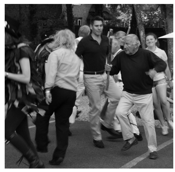
Whoa... steady boy, steady!