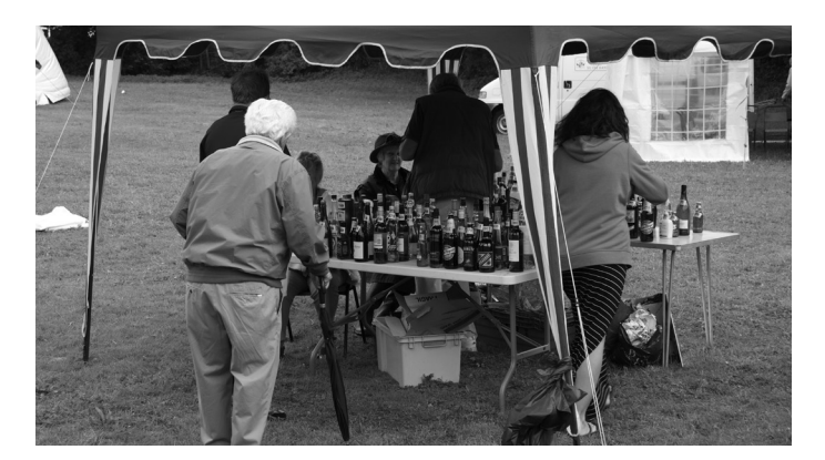
Bottle Stall Thanks

Exactly one week before the Village Show we had been given just four bottles; one week later, we had more than 150! Despite atrocious weather the Stall made nearly £400. Imagine how much more we could have made if we'd had glorious weather?