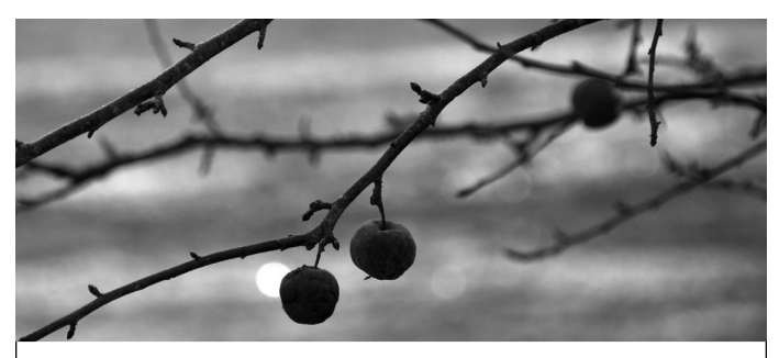
Ragged Apple different, personal, effective

graphic design • web design • photography copywriting logos, stationery, brochures, press adverts leaflets, posters