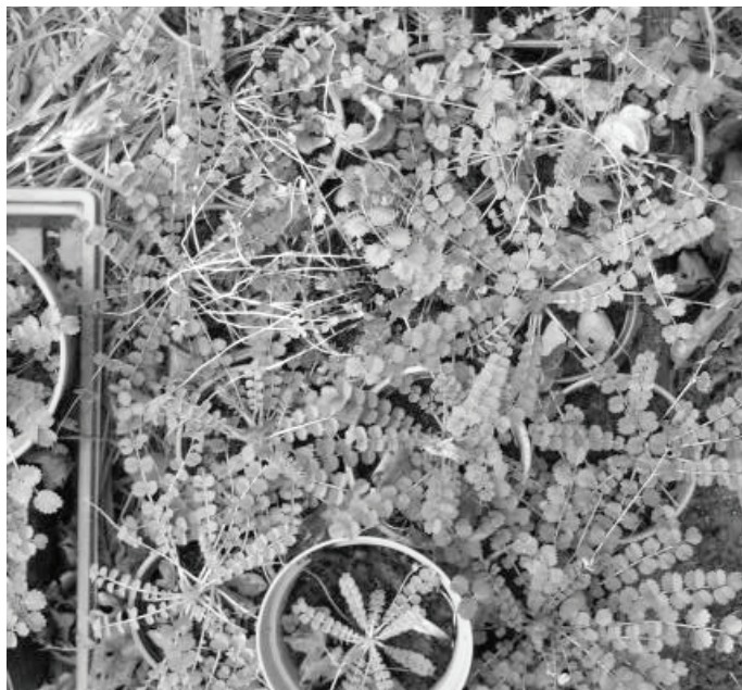
Salad Burnet is one of the wild flower varieties being grown in the CHS polytunnel