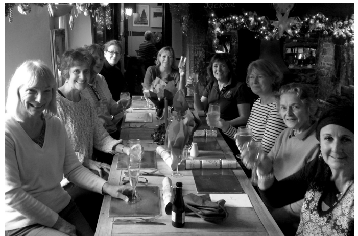
Get Fit Christmas Lunch!