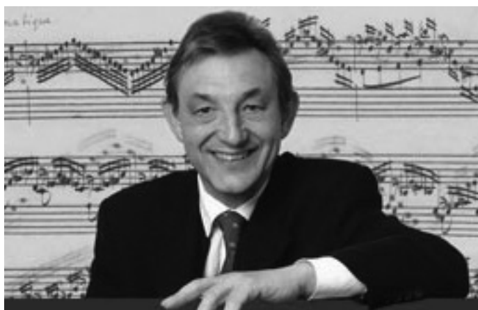
World-renowned harpsichordist Trevor Pinnock at Ashley Wood Farm, Tisbury SP3 6PY 12 March, from 7.30pm, concert at 8.15pm.

Cherubim Music Trust is greatly honoured that Trevor Pinnock CBE is donating one of the few concert performances he is giving in Britain this year for the benefit of the Trust. It is a rare opportunity hear an internationally acclaimed performer in Tisbury. The programme includes two great favourites: Bach's Chromatic Fantasy & Fugue and Handel's Harmonious Blacksmith.